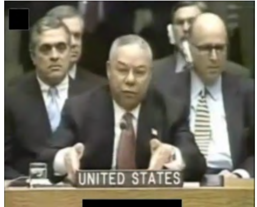
Colin Powell, Feb. 5, 2003

http://www.youtube.com/watch?v=IImVN1dmGuY