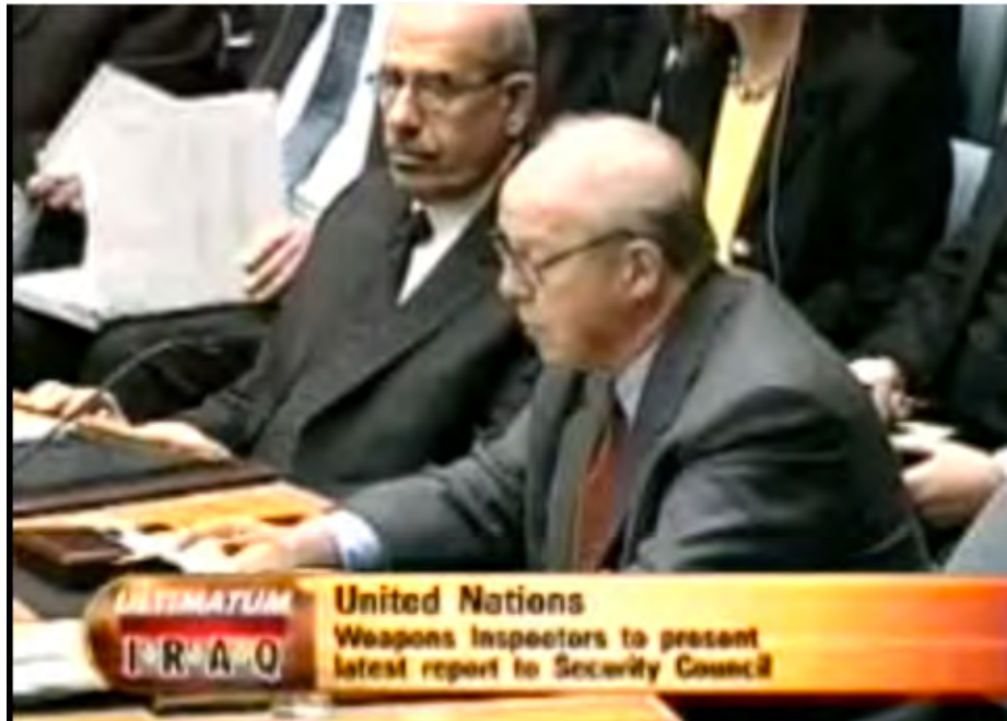
Hans Blix, March 7, 2003

http://www.youtube.com/watch?v=IImVN1dmGuY